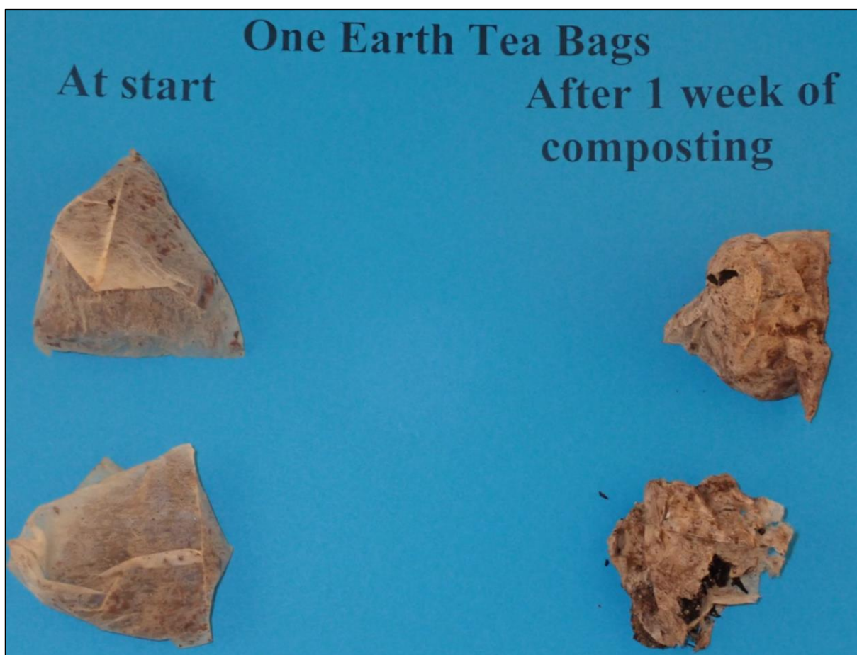
Figure 2. visual comparison between The One Earth® Tea Bags at start and after 1 week of composting

Normally the test still lasts 8 weeks. Because complete disintegration of both samples was obtained after 21 days, the test was stopped after 28 days.